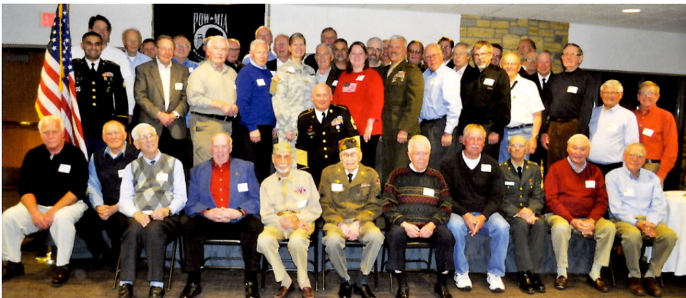
2013 Veterans Recognition Event